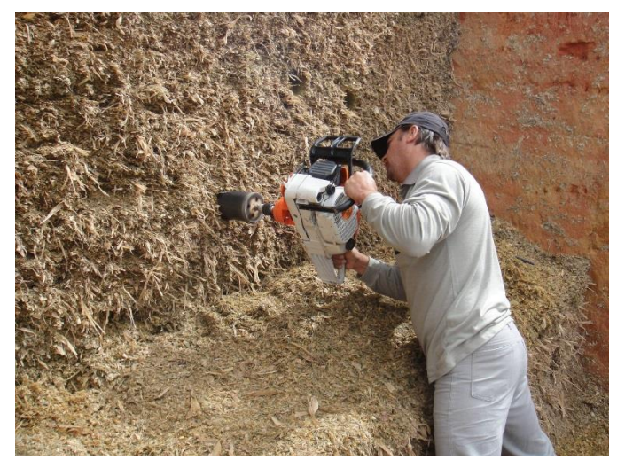
Figure 1. Cylinder and chainsaw in use.

Penetrometer resistance values (in megapascal, MPa) were correlated with the SM values (kg/m<sup>3</sup>) obtained with use of the cylinder coupled to the chainsaw by a polynomial regression study. The regression equations obtained were used to calculate the values of SM for natural matter (SMNM) and dry matter (SMDM) in each silo (in Table 1: estimated SMNM and estimated SMDM) and these were compared with the values obtained by the