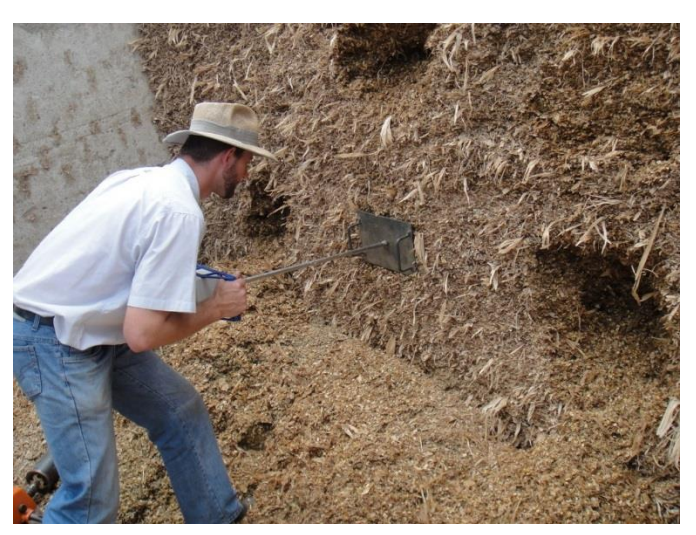
Figure 2. Penetrometer in use.

direct method (in Table 1: observed SMNM and observed SMDM). Data were not statistically analyzed, considering that there was no replication (silo), since the silos were evaluated on different farms and factors other than the type of assessed silo and silage (maize) may present different characteristics. Therefore, the values obtained for the SMNM and SMDM were descriptively analyzed.