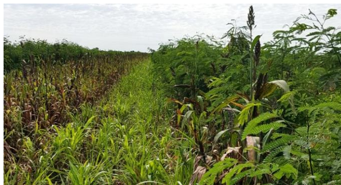
Figure 4. Leucaena intercropped with sorghum for silage in Pampa del Infierno, Chaco, Argentina.