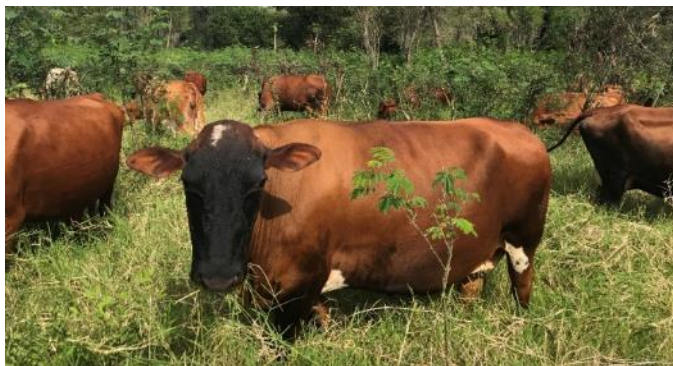
Figure 2. Intensive silvopastoral system with leucaena - Cynodon plectostachyus pasture in the tropical dairy system at El Hatco, Valle del Cauca, Colombia.

grazing is carried out 3–6 months after planting leucaena using a low stocking rate, followed by a pruning of leucaena at 0.5–0.75 m for stimulating growth of branches. Leucaena-grass pasture is managed using intensive rotational grazing (12–48 hours) with electric fences and permanent supply of water, followed by 40–45 days for pasture recovery. The main use of iSPS is for feeding beef cattle, dual-purpose cattle and cows on tropical dairy farms (Figures 2 and 3). It is important to mention that leucaena toxicity is not considered as a limitation; therefore animal inoculation with the rumen bacterium Synergistes jonesii is not a common practice