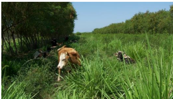
Figure 3. Intensive silvopastoral system with Leucaena leucocephala and Megathyrsus maximus at Apatzingán, Michoacán, Mexico. Some leucaena is allowed to grow tall to provide shade.