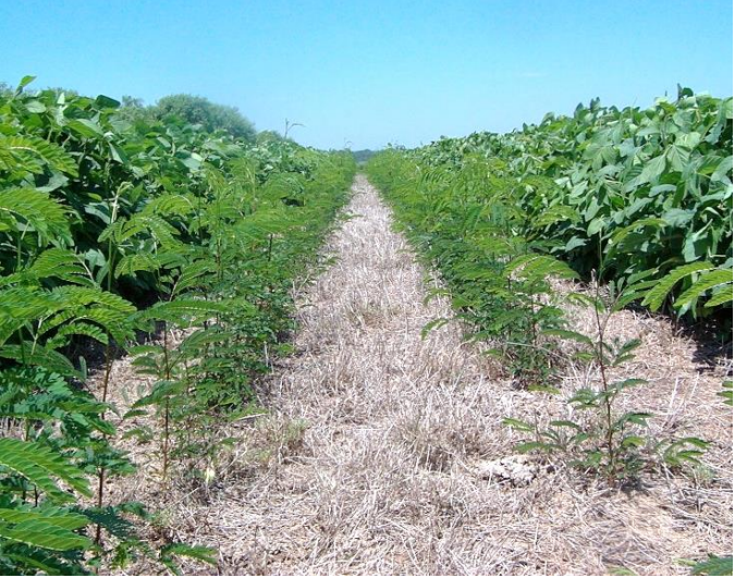
Figure 7. Leucaena establishment with zero-tillage in strips in a soybean crop in humid Eastern Paraguay.

Table 1. Carrying capacity and liveweight production per ha of steers grazing Gatton panic alone and Gatton panic with leucaena sown in twin rows (<u>Glatzle and Klassen 2004</u>). AU = Animal Unit = 450 kg live weight.