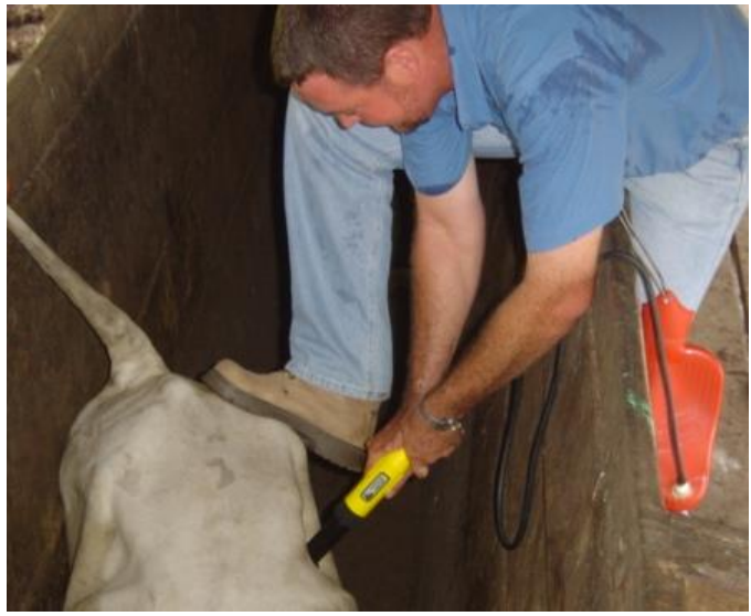
Figure 2. Transmission of ruminal fluid with a rumen injection gun supplied from a flexible rubber bottle to avoid suction of air.

in the absence of mimosine. On commercial beef ranches some steers are usually kept as donor animals on leucaena pasture for most of the year. These animals are mixed with groups of 'naïve' steers to provide a source of inoculum when these groups enter leucaena for fattening. When fattened animals are sold, the lightest ones are usually held back and mixed with the next group for fattening.