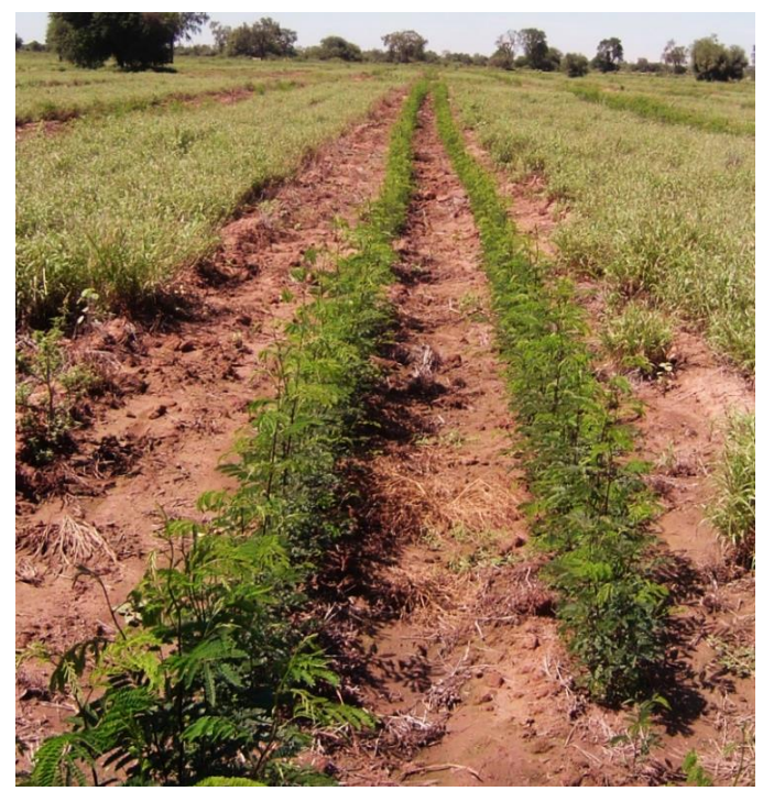
Figure 5. Leucaena sown in twin rows into Gatton panic pasture, previously tilled in strips.