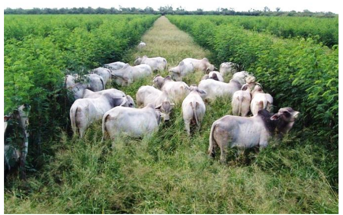
Figure 8. Brahman bulls grazing leucaena sown in twin rows in Gatton panic pasture.