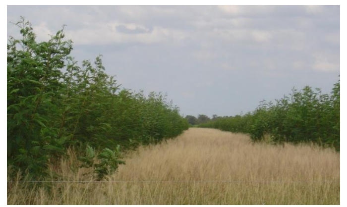
Figure 9. The presence of leucaena in pastures boosts animal performance, particularly in winter, when grass is dry and of low quality.