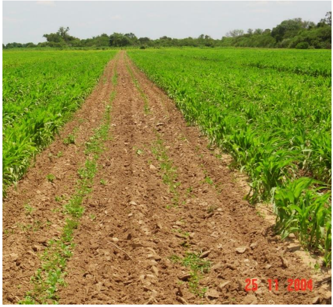
Figure 6. Leucaena establishment in twin rows accompanied by a sorghum crop in the first year.