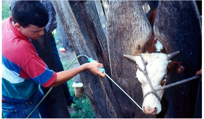
Figure 3. Oral application of ruminal fluid is less risky for the recipient animal but requires more restraint.