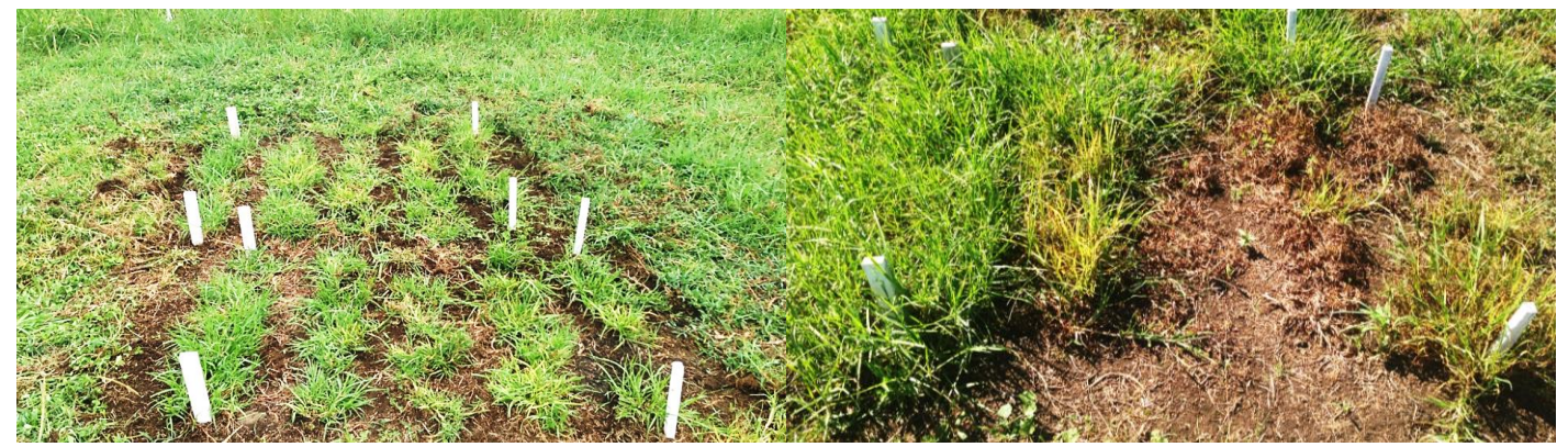
Figure 2. The status of kikuyu lines in Replicate 2 at Site 1 at 38 days after planting (left) and 130 days after planting (right). Lines (from left to right) are: 12A (all green), 11C (2 dead, 2 yellow, 1 green), Whittet (all dead), 15A (4 dead, 1 yellow) and 25D (3 dead, 1 yellow).

<sup>1</sup>There were only 16 plants available for line 25D at Lismore.