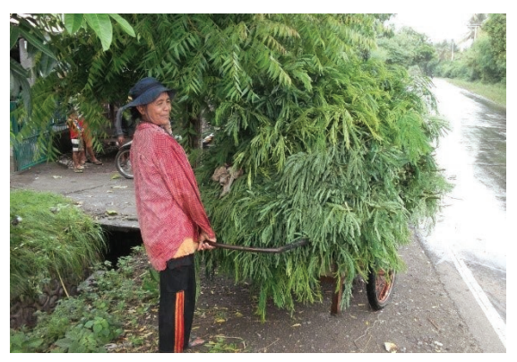
a. Leucaena harvested by a farmer.

and riversides or bought from other farmers. They also provided other feedstuffs such as Gliricidia ( Gliricidia sepium ), crop residues and by-products (rice straw, corn stover, peanut haulms and rice bran) to supplement the diet when leucaena was not fed as 100 % of the diet, especially for non-fattening cattle classes, and during the dry season. Conversely, all non-leucaena-using farmers managed their cattle extensively with a lowinput system.