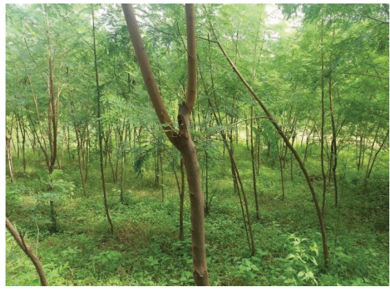
a. Farmer's land planted with leucaena.

planting areas and leucaena areas, but some farmers integrated broadacre and leucaena crops in an alley cropping configuration (Figure 3).