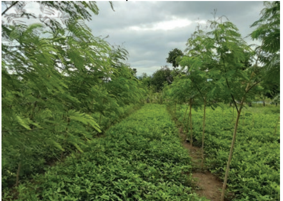
b. Leucaena integration with peanuts. Figure 3. Leucaena planting systems for cattle in Sumbawa.

Rainfed farm also had more cattle (P<0.05) than irrigated farms with the difference lying in the number of bulls fattened (Table 2). Meanwhile the number of cattle in other classes (breeding cows and bulls plus growers) did not differ (P>0.05) between land types.