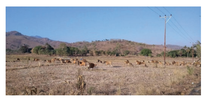
Figure 5. Lack of forage during the dry season in Sumbawa. Grasses and herbaceous forages are limited during this time, but trees, including forage tree legumes such as leucaena, retain green growth.

<sup>1</sup>LU= Leucaena users (%); <sup>2</sup>NLU= Non-leucaena users (%).