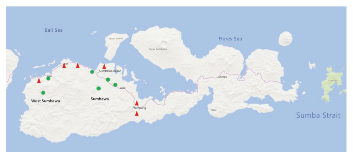
Figure 1. Map of Sumbawa Island, NTB Province of Indonesia showing the survey locations. A rainfed; Irrigated land.

equality of proportions between groups. T-tests were used for comparison of the means between groups. Univariate linear regressions were used to analyze correlations between continuous variables.