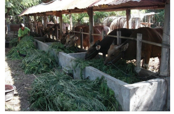
b. Leucaena being fed to fattening bulls. Figure 2. Leucaena feeding systems for cattle in Sumbawa.