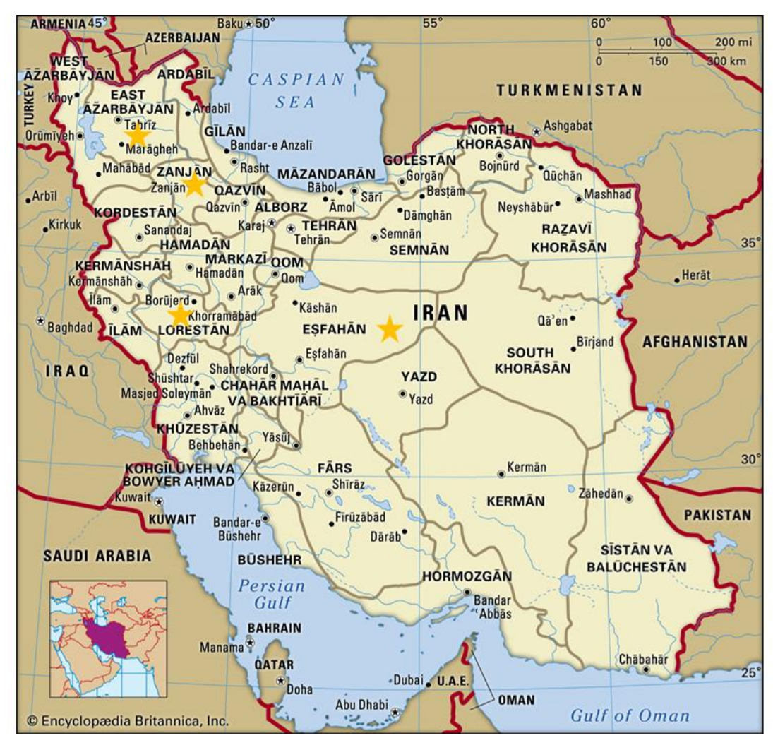
Figure 1. Map of Iran showing the 4 study locations in their respective provinces. Source: Encyclopædia Britannica.